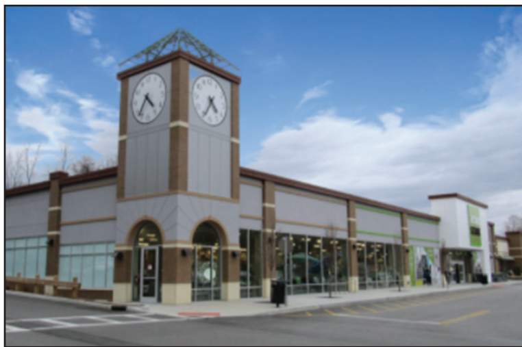
Opening last year is the striking "Cortlandt Crossing." This shopping hub won swift approval as the Town Board served as lead agency eliminating duplicate approvals and shorten the permitting process.