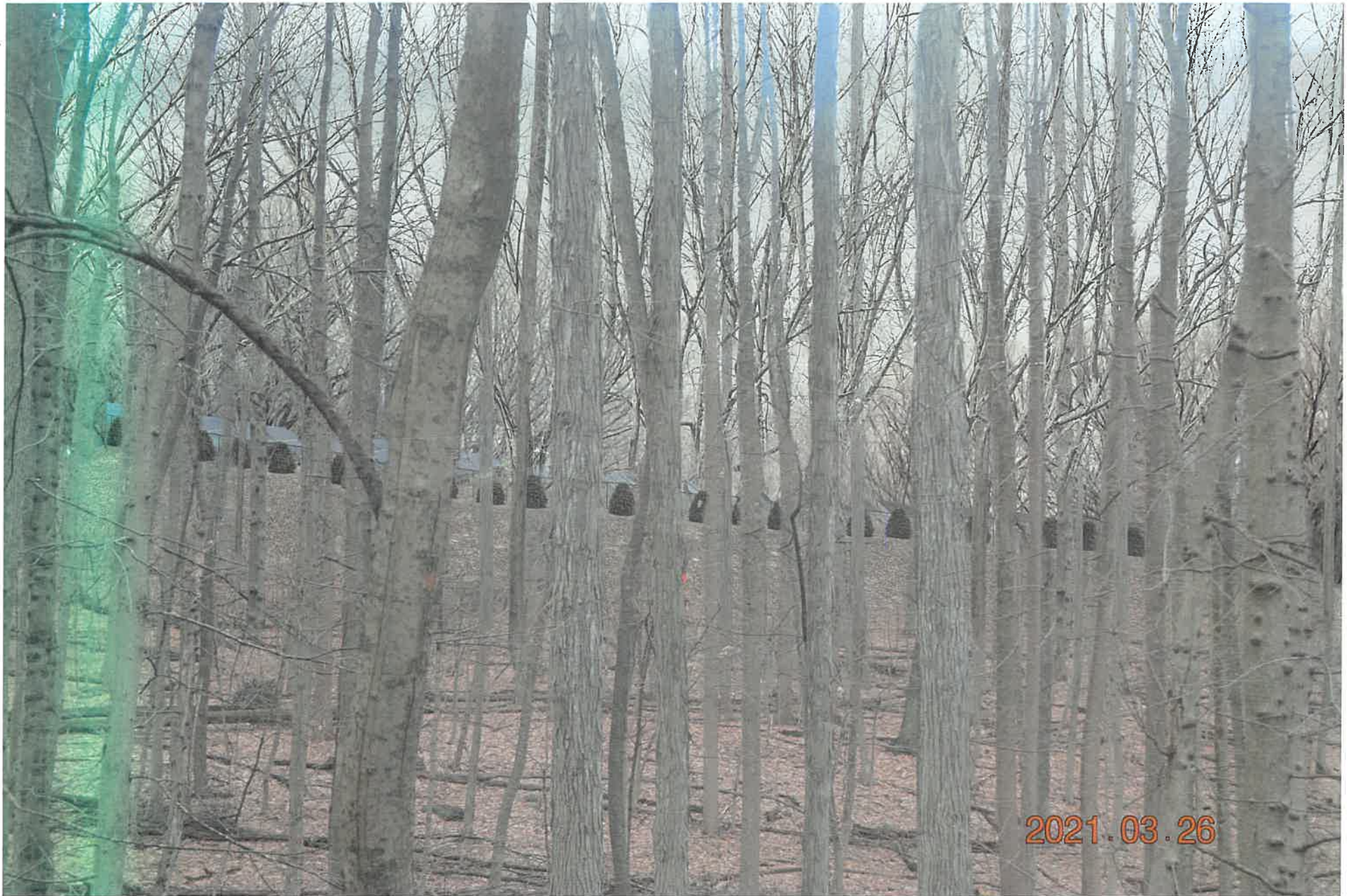
Photo Simulation – Proposed Conditions (With Evergreen Tree Screening)