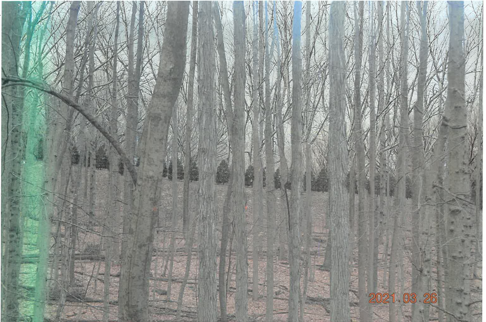
Photo Simulation – Proposed Conditions (With Mature Evergreen Tree Screening)