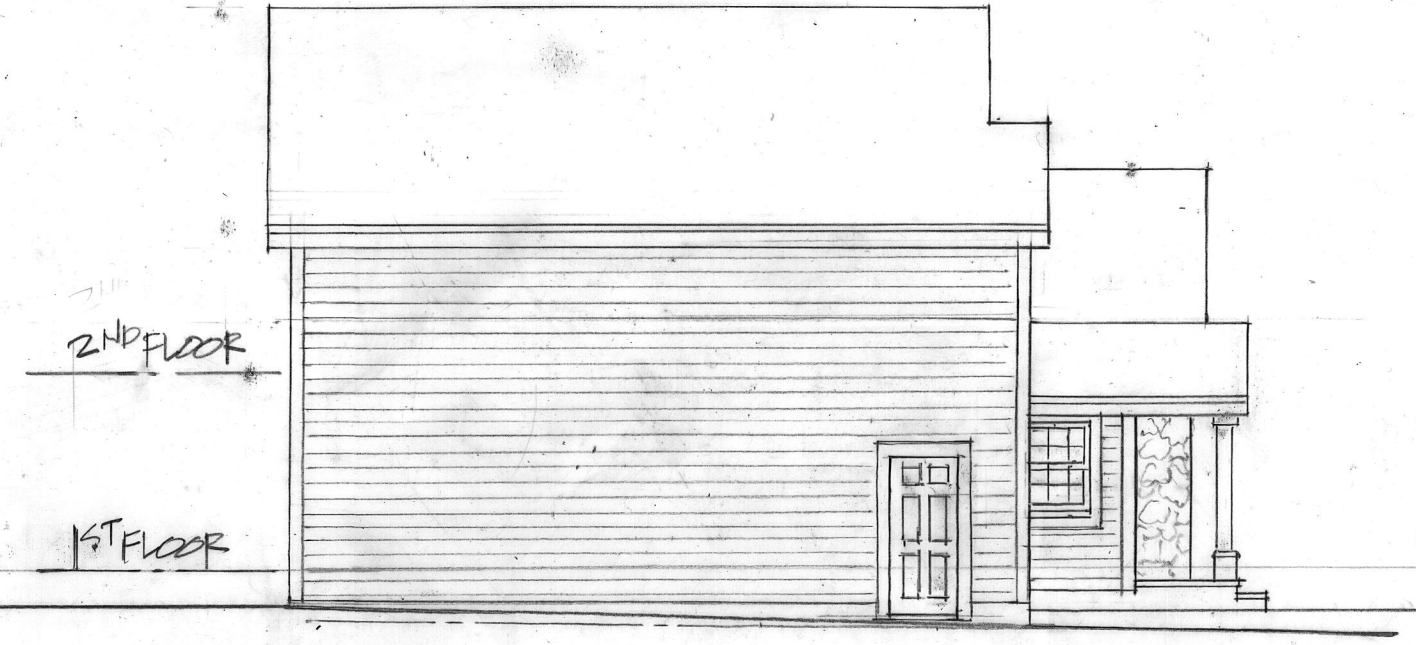
LEFT SIDE ELEVATION SCALE: 1/8" = 1'-0"

EXISTING CONSTRUCTION * PROPOSED NEW CONSTRUCTION