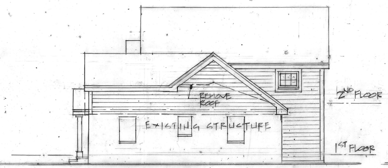
RIGHT SIDE ELEVATION SCALE: 1/8" = 1'-0"