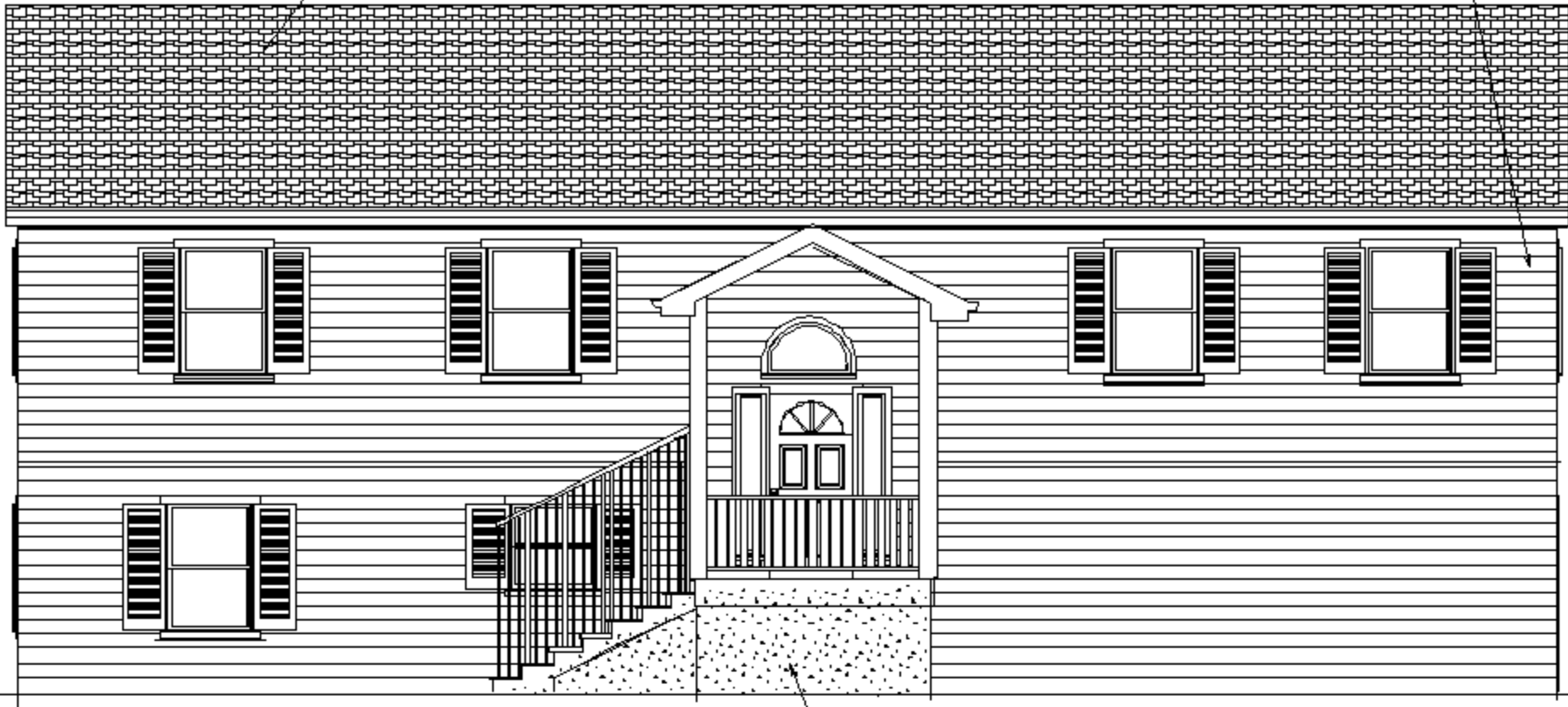
MASONRY STOOP FRONT ELEVATION