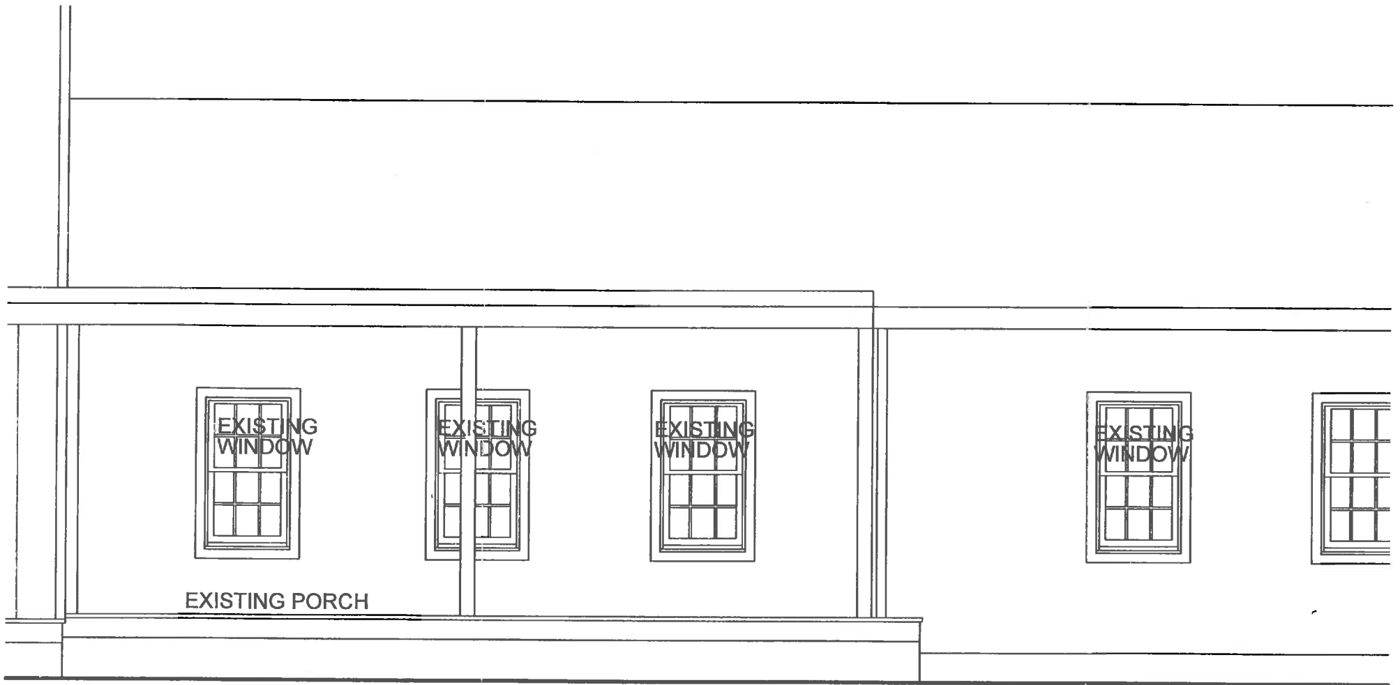
PARTIAL EXISTING FRONT ELEVATION - 1/4" = 1'-0"