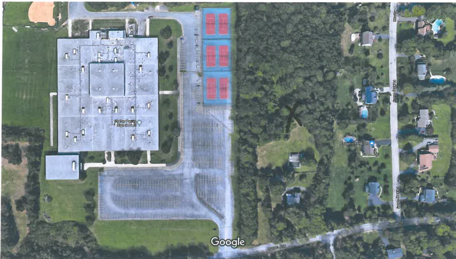
100 ft